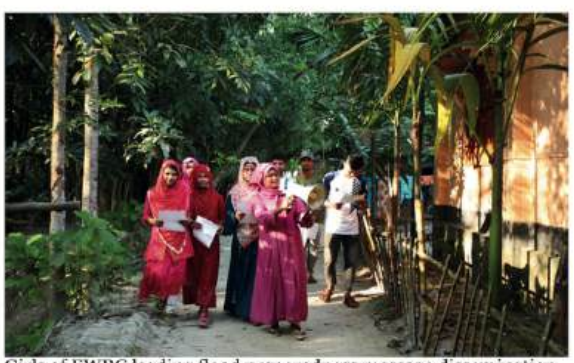
Girls of EWRC leading flood preparedness message dissemination.

Additionally, the project required extensive collaboration, time, and resources that were scarce. Concerns about the sustainability of the digital system post-project contributed to a reluctance to continue its development. Stakeholders feared that without adequate