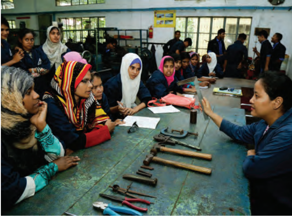
Harnessing half the workforce. Trainees on the Skills for Employment Investment Program in Chittagong, Thailand learn about different types of tools.

movement building both inter- and intra-generationally. Policymakers must ensure that young women and men are brought within the inner circles of decision-making, including with governments, the private sector and civil society.