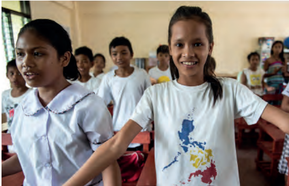
Smiles and hope. Emergency Assistance programs support young people following Typhoon Yolanda in the Philippines.

5 As co-designers of initiatives and as “provocateurs” (in program design) across all 17 SDGs, but especially those directly impacting them such as education, gender and employment.