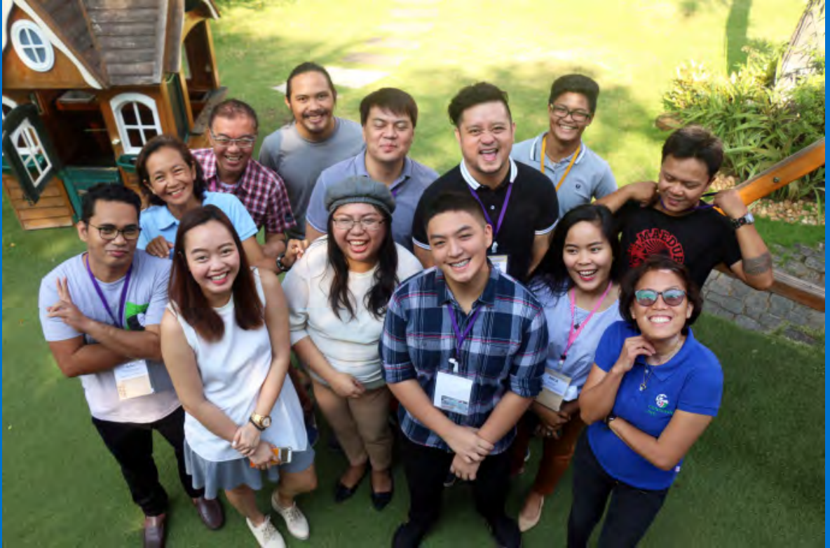
Back cover: Young people leading disaster preparedness innovations in the Philippines.

ADB is committed to achieving a prosperous, inclusive, resilient, and sustainable Asia and the Pacific, while sustaining its efforts to eradicate extreme poverty. Established in 1966, it is owned by 67 members—48 from the region. Its main instruments for helping its developing member countries are policy dialogue, loans, equity investments, guarantees, grants, and technical assistance.