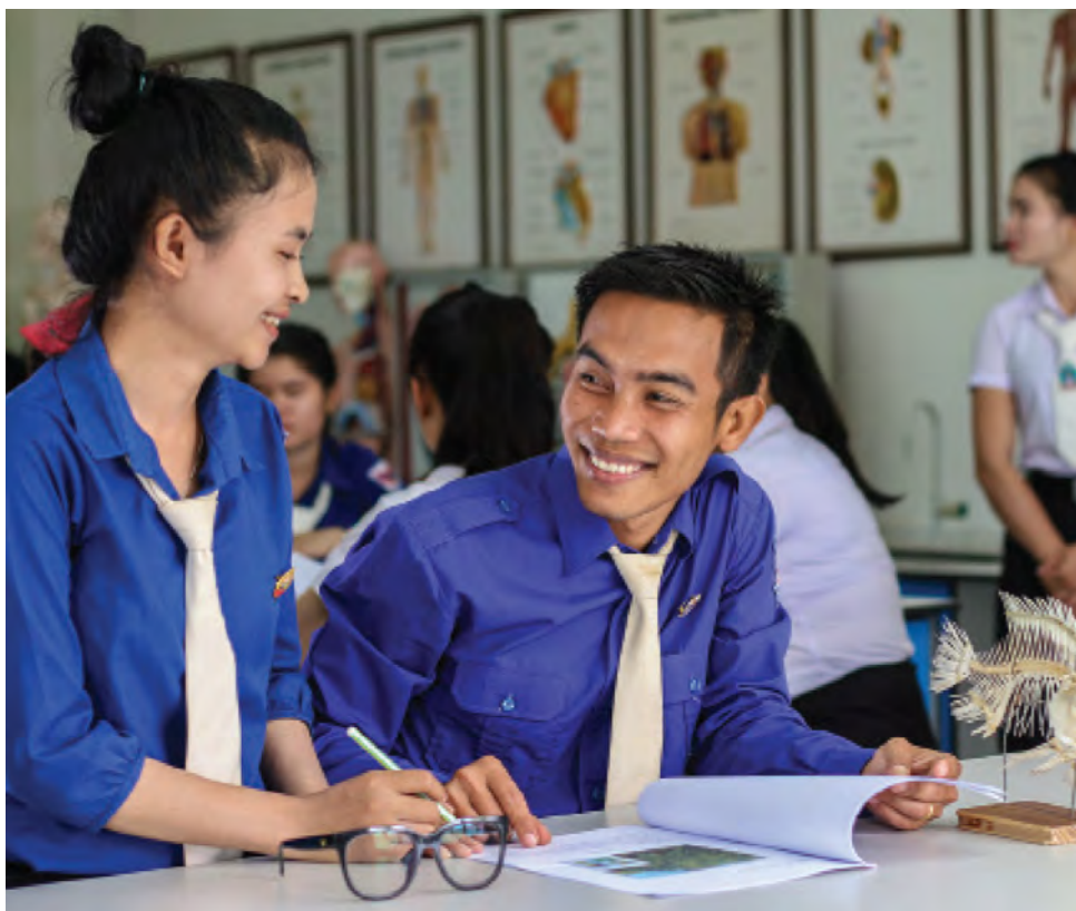
By youth for youth. Young people participate in a Youth for Asia project in Lao People's Democratic Republic that is working to expand and strengthen the Higher Education system.

Essentially, these recommendations indicate where governments and development partners should invest to