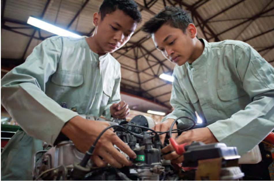
Hands-on. Participants in the Vocational Education Strengthening Project in Indonesia learn how to use automobile plant equipment in a training centre.

people because the project was initially supposed to be about teenage pregnancy.”