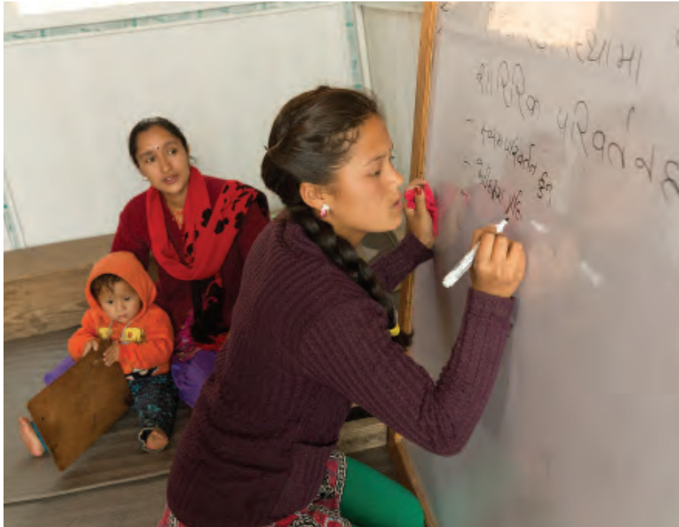
Voice on ink. Maya shares her views during a session at her local Adolescent Friendly Space in Dolakha, Nepal.

genders and backgrounds, to be heard by leaders. 27 While education, better healthcare and jobs come across as overall priorities, globally all under-15s ranked job opportunities priority number two. However, in Asia, youth rated a secure job as only the sixth priority, while “protection against crime and violence” was rated higher in Asia than in any other region and “honest and responsive government” was young people’s second highest priority. AIESEC’s YouthSpeak survey, which asked 160,000 young people to say which SDGs they identified with the most, voted overwhelmingly for SDG 4: Quality education, followed by SDG 1: No poverty and SDG 3: Good health and well-being.