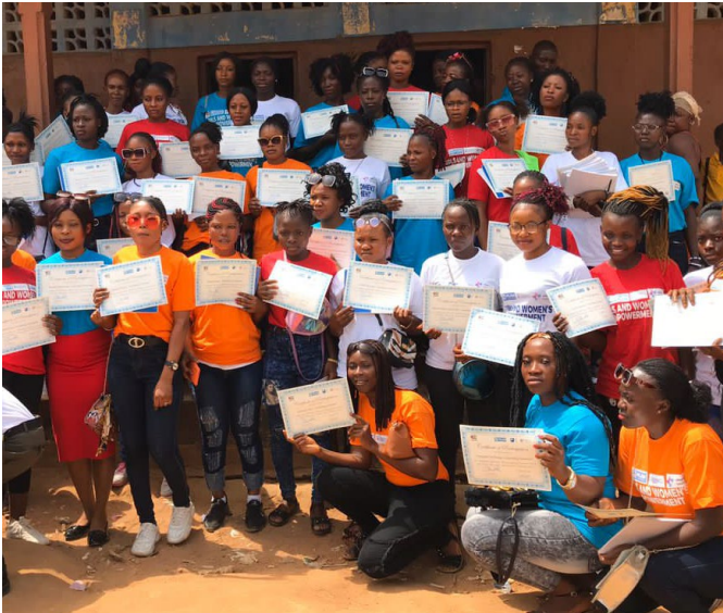
Young women on their way to becoming qualified teachers

Creating a brighter future for young women and contributing to a skilled and diverse teaching workforce.