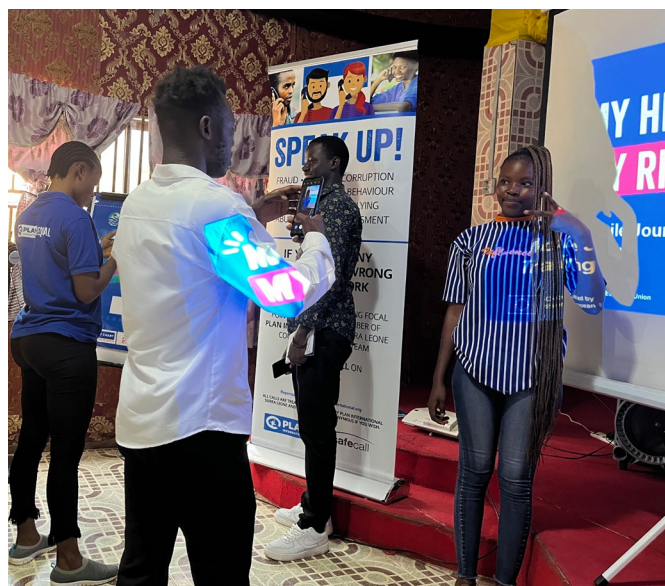
Young aspiring mobile journalists during the training

One participant from Moyamba District shared her experience, saying, “Through this training, I have gained the ability to edit videos, capture high-quality photos, and improve my writing skills. Now, I can tell stories that impact my community using just my mobile phone. Before the training, I used social media just for fun, but now the MoJo training has opened my eyes to the various ways I can utilize social media.” Plan International is incredibly proud of the achievements of these young Mobile Journalists. They are equipped with the necessary tools and skills to create impactful content, bringing attention to the issues that matter most to their communities.