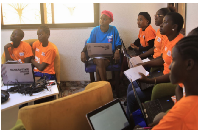
Girls and young women learning how to code during Girls in ICT Day

Her Center creates a safe, multicultural space where innovators, creative minds, and problem solvers come together to create solutions to pressing challenges affecting people. Using a human-centered, problem-solving approach, the Center uses 21st-century entrepreneurial leadership and STEM (Science, Technology, Engineering, Math) education concepts to harness the untapped potentials of young people. In order to expand her portfolio PISL handed over a 3D printer and 10 drones to her centre.