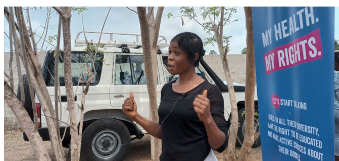
Young woman practicing her MoJo skills