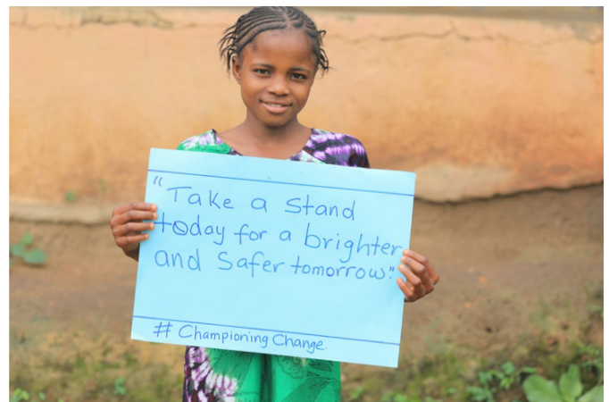
Mamusu is part of the Champions of Change

The Safer Schools for Girls (SS4G) project, is dedicated to addressing School Related Gender-Based Violence (SRGBV) and creating a safe learning environment for girls in the Koinadugu district. A comprehensive approach is taken that focuses on the individual, community, and institutional levels.