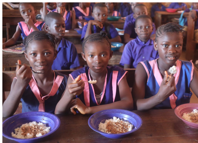
Girls eating their school meal

One effective way to enhance accessibility to education for children is through school feeding programs. These programs aim to provide students with a daily nutritious diet while attending school. Therefore ISFP serves as a vital platform for children to access education. The project ensures