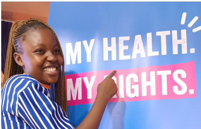
Young woman part of the My Health My Rights MoJo training

Let's start talking - Girls, in all their diversity, have the right to be educated and make active choices about their bodies.