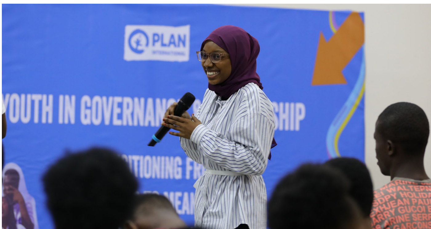
Young woman speaking during Plan International's Youth in Governance and Leadership event

Contribute to increased access to adequate water supply, improved sanitation, and hygiene behaviour practices to improve outcomes for children in targeted communities.