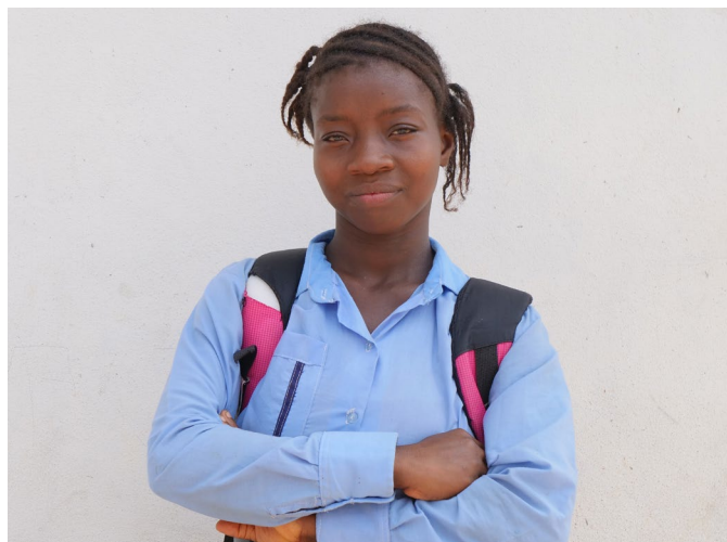
Princess, 17, is not afraid to speak up anymore thanks to She Leads

She Leads is dedicated to working with girls and young women, as well as engaging stakeholders (e.g. parents, government institutions) and boys and young men. The project aims to create a supportive environment where girls and young women can thrive and become influential leaders in their communities. Our primary goal is to enhance the leadership skills of girls and young women, providing them with mentors and empowering them to raise their voices and actively participate in decision-making processes. Girls and young women have actively planned and delivered their activities over the last year. Over a five year duration the project aims to reach 4,500 girls and young women.