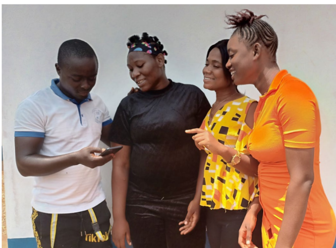
Youth practicing mobile journalism

One participant from Moyamba District shared her experience, saying, “Through this training, I have gained the ability to edit videos, capture high-quality photos, and improve my writing skills. Now, I can tell stories that impact my community using just my mobile phone. Before the training, I used social media just for fun, but now the MoJo training has opened my eyes to the various ways I can utilize social media.” Plan International is incredibly proud of the achievements of these young Mobile Journalists. They are equipped with the necessary tools and skills to create impactful content, bringing attention to the issues that matter most to their communities.