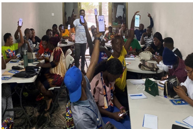
Young people getting trained as Information Focal Points

mobile phones capable of sending SMS messages, they play a crucial role in gathering feedback and information from the project communities. By using Telerivet and engaging young people as IFPs, we create a trusted and safe space where community members can share their thoughts, concerns, and suggestions. This feedback is vital for us to continuously improve our projects and ensure that they meet the needs of the community.