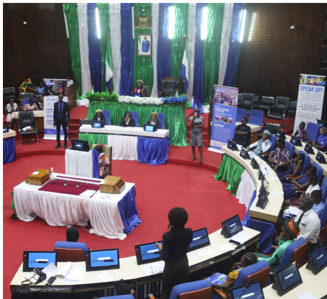
Girls and Young Women at the Well of Parliament

The Government of Sierra Leone passed the ground-breaking Gender Equality and Women's Empowerment Act 2022 into law on the 19th of January 2023. This is a win for all women in Sierra Leone and gives hope and aspiration to future generations. The GEWE Act sets an opportunity to lastingly improve the broader socio-economic conditions for women and increase their representation in Sierra Leone. It aims to advance key priorities including reserving 30% of elective and public office positions for women, strengthening gender mainstreaming and introducing gender-responsive budgeting, and expanding access to finance.