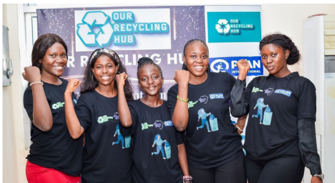
Our Recycling Hub funded by the YCF in 2023

Through the Plan International West and Central African office, a Regional Youth Challenge Fund (YCF) has run for the last two years. Sierra Leone has had youth groups funded through this both years, including innovation ideas such as solar school backpacks.