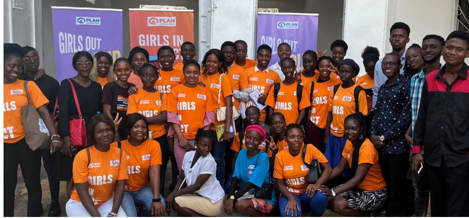
Girls in ICT celebration at the Kamara Yokie Innovation Center

Plan International Sierra Leone has joined forces with the Kamara Yokie Innovation Center, the Orange Foundation, the Ministry of Youth, and the Sierra Leone Directorate of Science, Technology and Innovation (DSTI) in an exciting celebration to mark Girls in ICT Day 2023. This was designed to empower girls and young women in the realm of Information and Communication Technology (ICT).