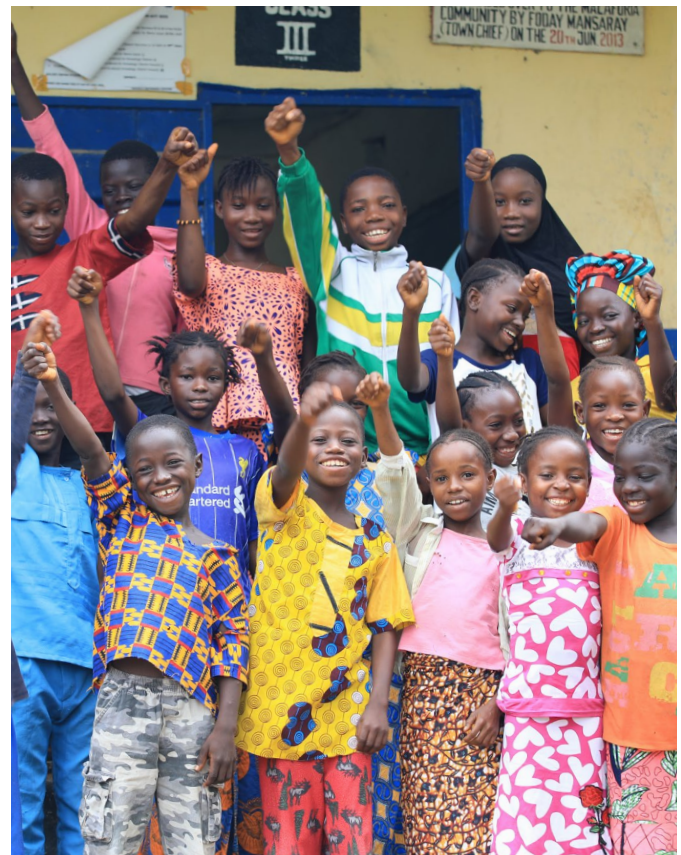
Girls and Boys part of the Champions of Change