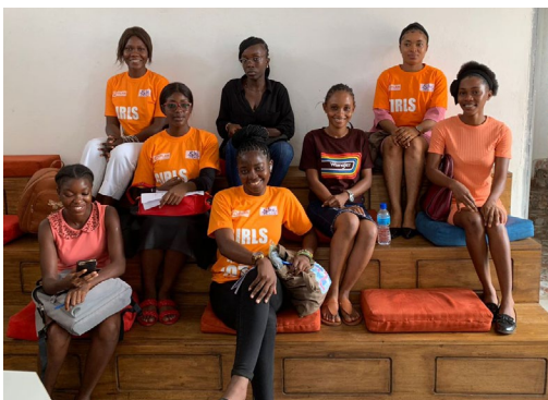
Girls during the Mobile Journalism training