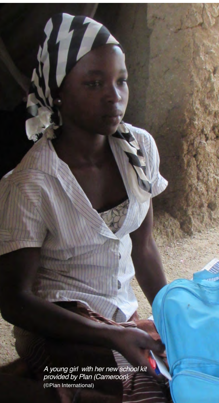
A young girl with her new school kit provided by Plan (Cameroon).