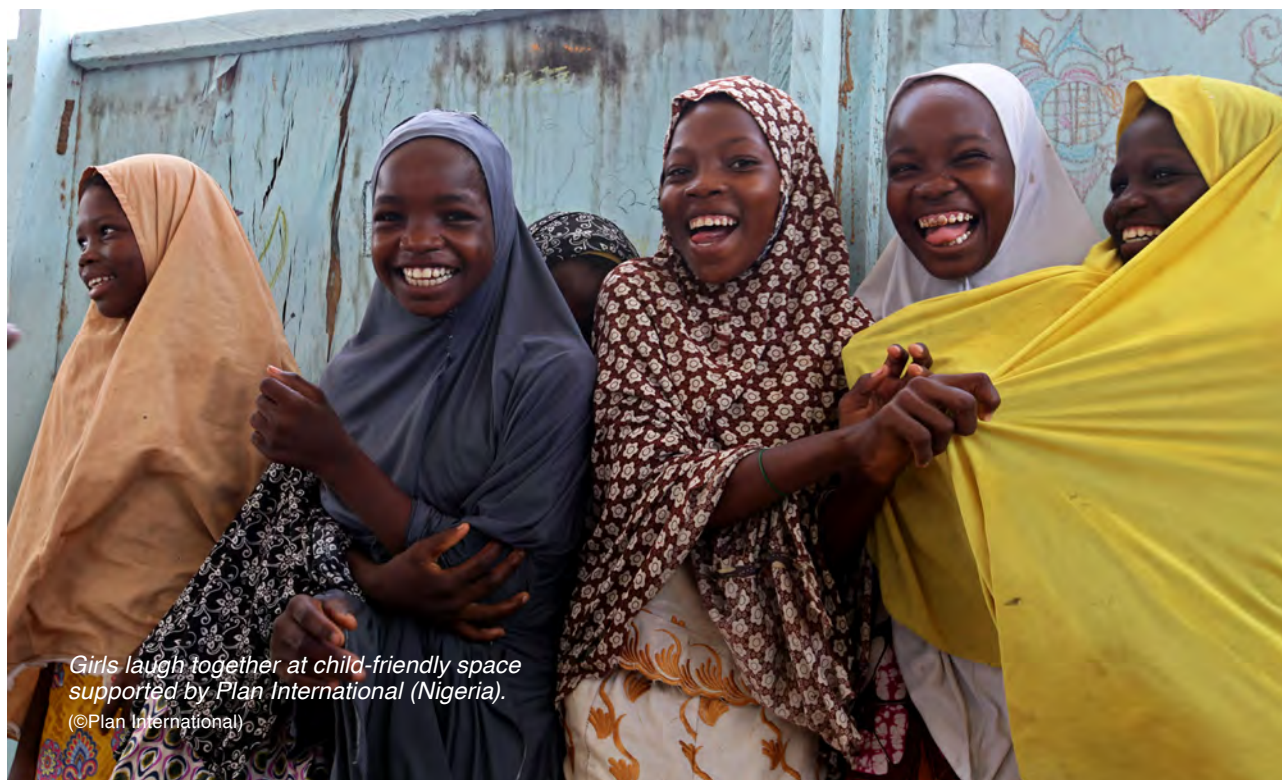
Girls laugh together at child-friendly space supported by Plan International (Nigeria).