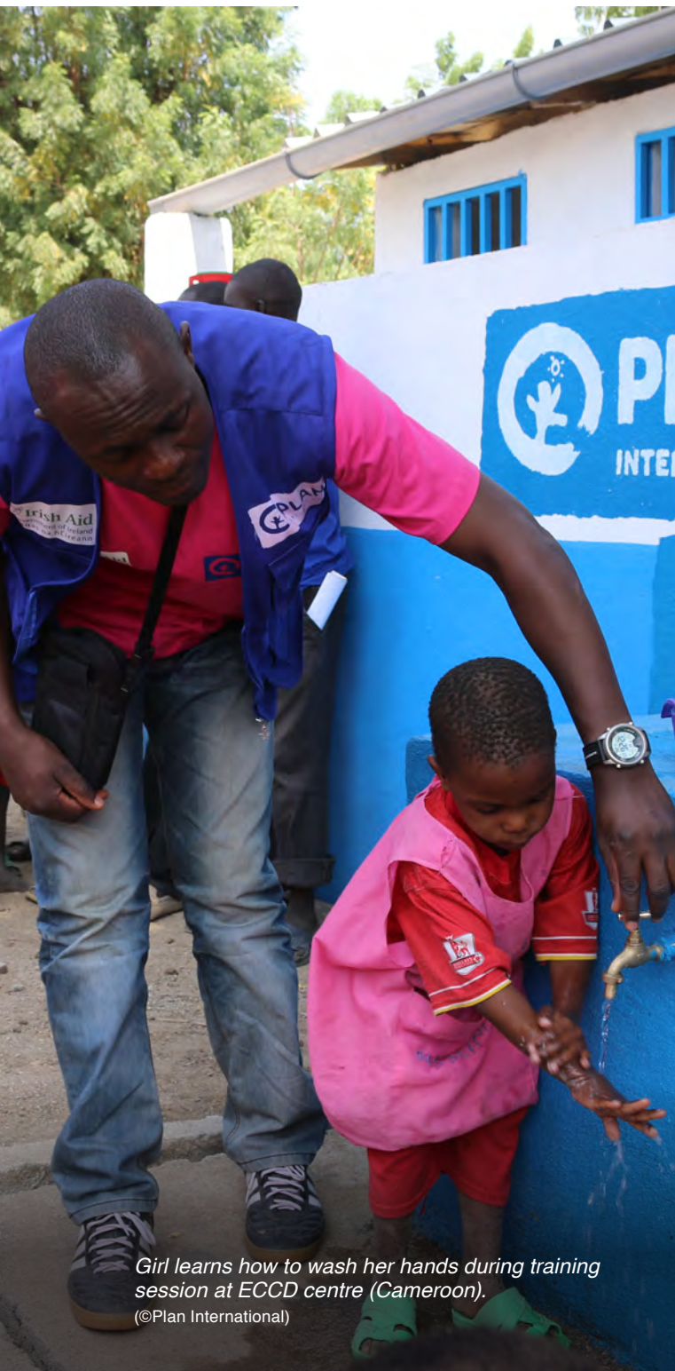
Girl learns how to wash her hands during training session at ECCD centre (Cameroon).

Plan International observes these rights violations conducted by boys, women and men, families, communities, governments, non-state actors, including armed non-state actors, and international bodies. In delivering the Overall Programme Goal that Girls and boys in the Lake Chad region realise their rights in safety and dignity , the LCP will put girls and boys at the heart of its beliefs, values and approaches. The programme will walk with and work with girls and boys from birth to adulthood to deliver four Specific Programme Objectives.