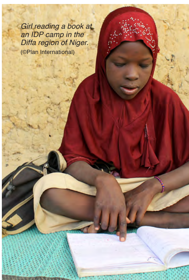
Girl reading a book at an IDP camp in the Diffa region of Niger.

The Lake Chad Programme is developing an integrated approach to Monitoring, Evaluation, Research and Learning (MERL) to ensure they feed into each other and allow us to make MERL effective within the programme. The application of the existing standards to each piece of MERL work will be critical. It is envisaged to further strengthen the capacities of colleagues at country level within the programme to that regard.