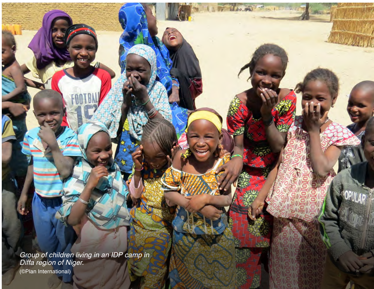
Group of children living in an IDP camp in Diffa region of Niger.