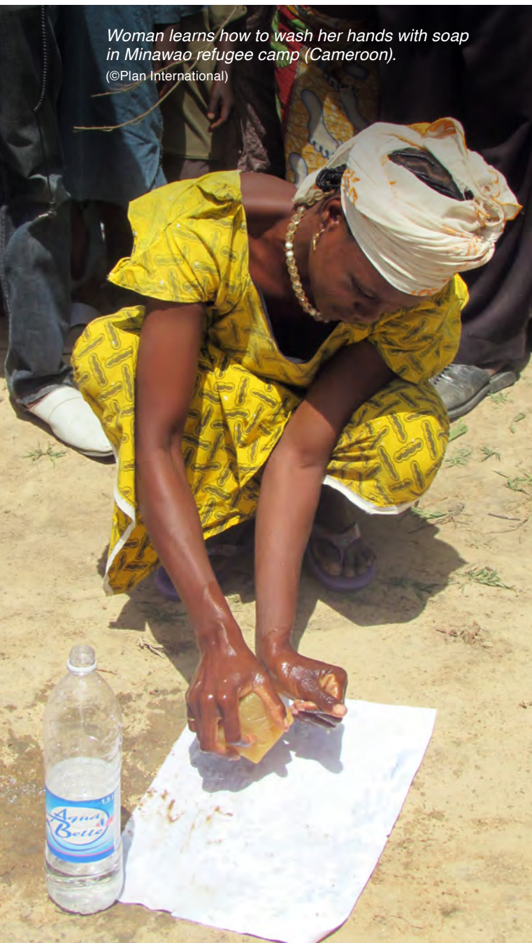
Woman learns how to wash her hands with soap in Minawao refugee camp (Cameroon).