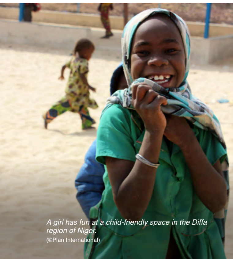
A girl has fun at a child-friendly space in the Diffa region of Niger.