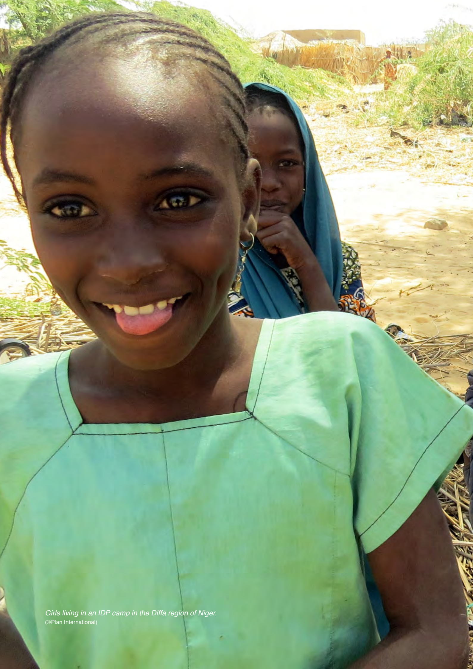
Girls living in an IDP camp in the Diffa region of Niger.