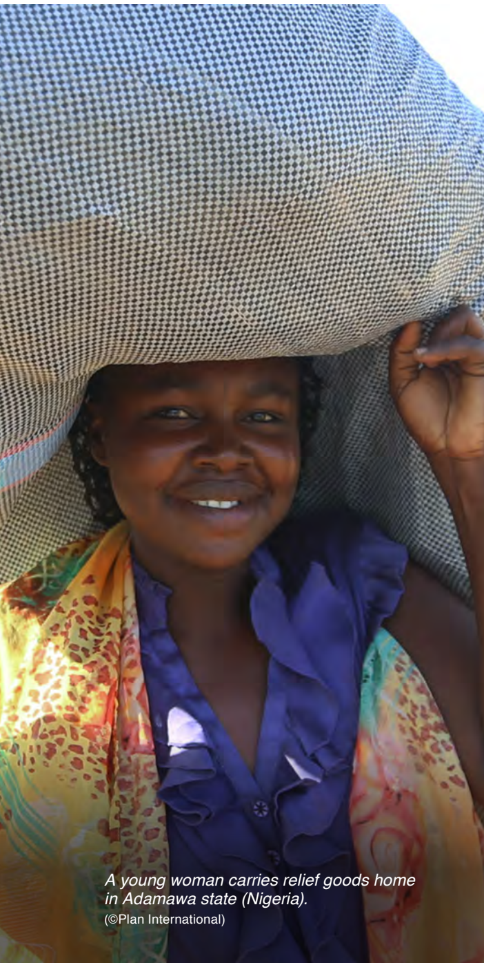
A young woman carries relief goods home in Adamawa state (Nigeria).

The set-up of the Lake Chad Programme came with the necessity of a centralised coordination of the actions and interventions in the countries. In this regard, the Lake Chad Programme Unit was established as a shared resource for the countries responding to the Lake Chad Crisis. The Real Time Review conducted in March 2018 confirmed the increasingly pivotal role of the unit as follows: “The Lake Chad Response is in a position through the coordination unit team to strengthen the projects in line with a common results framework, develop an influence and advocacy strategy building on practices in each CO, not just programmatically but also operationally, and capitalising on the position of Plan International in each CO, to reach a regional and global audience. Additionally, through formalized evidence-based documentation of the impact of Plan International’s activities, increased engagement with donors and NOs could occur.”