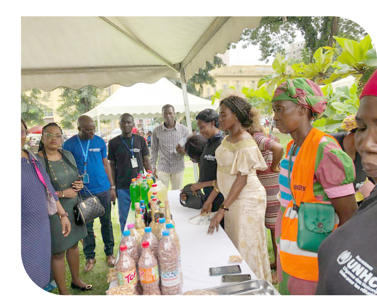
Refugees exhibiting their products in Douala

In Bertoua, Cameroon's East Region, World Refugee Day was marked with sensitization sessions on peace, advocacy with local leaders, and activities celebrating refugee contributions. Children danced joyfully, underscoring unity amidst efforts to promote refugee rights and durable solutions by UNHCR and partners.