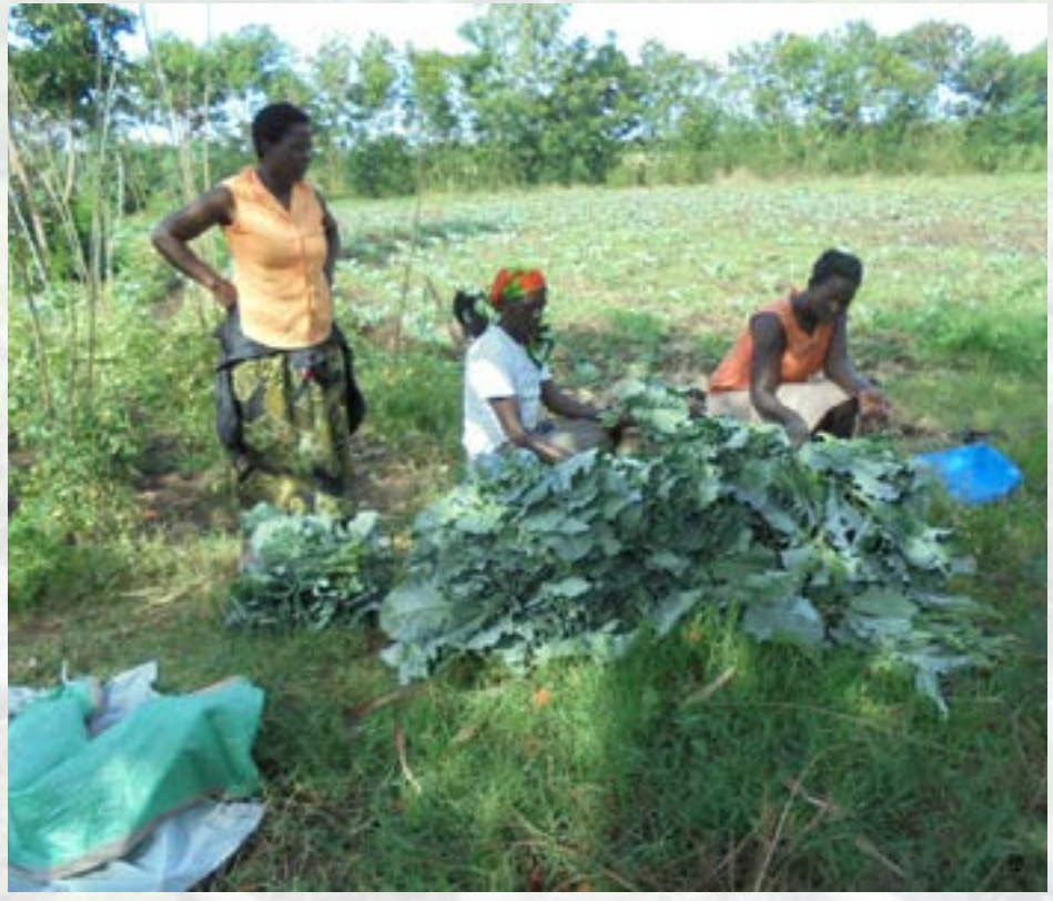
Group members with harvested vegetables ready to sell.

Agriculture has been and remains a fundamental part of Kenya's economy; however, due to structural changes in the sector, the economic crisis of the past decade and recent droughts, Kenya's agricultural sector has declined precipitously and many parts of the country are no longer food self-sufficient. Siaya County is one of the counties affected by food insecurity.