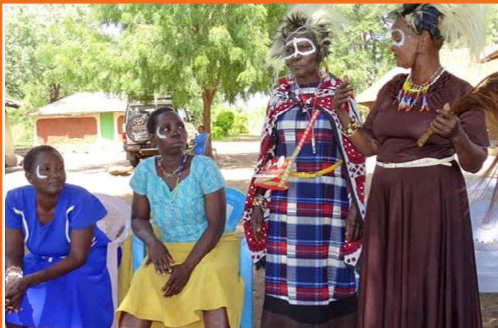
Reformed circumcisers from Tharaka Nithi and Kajiado sharing their experiences during the exchange programme.

The Obligation to Protect Project in Tharaka Nithi and the Yes I do Project in Kajiado held an exchange visit which brought together reformed circumcisers, Njuri Ncheke and Maasai Elders. The aim of the visit was to share their experiences and their roles in ending FGM in their respective regions.