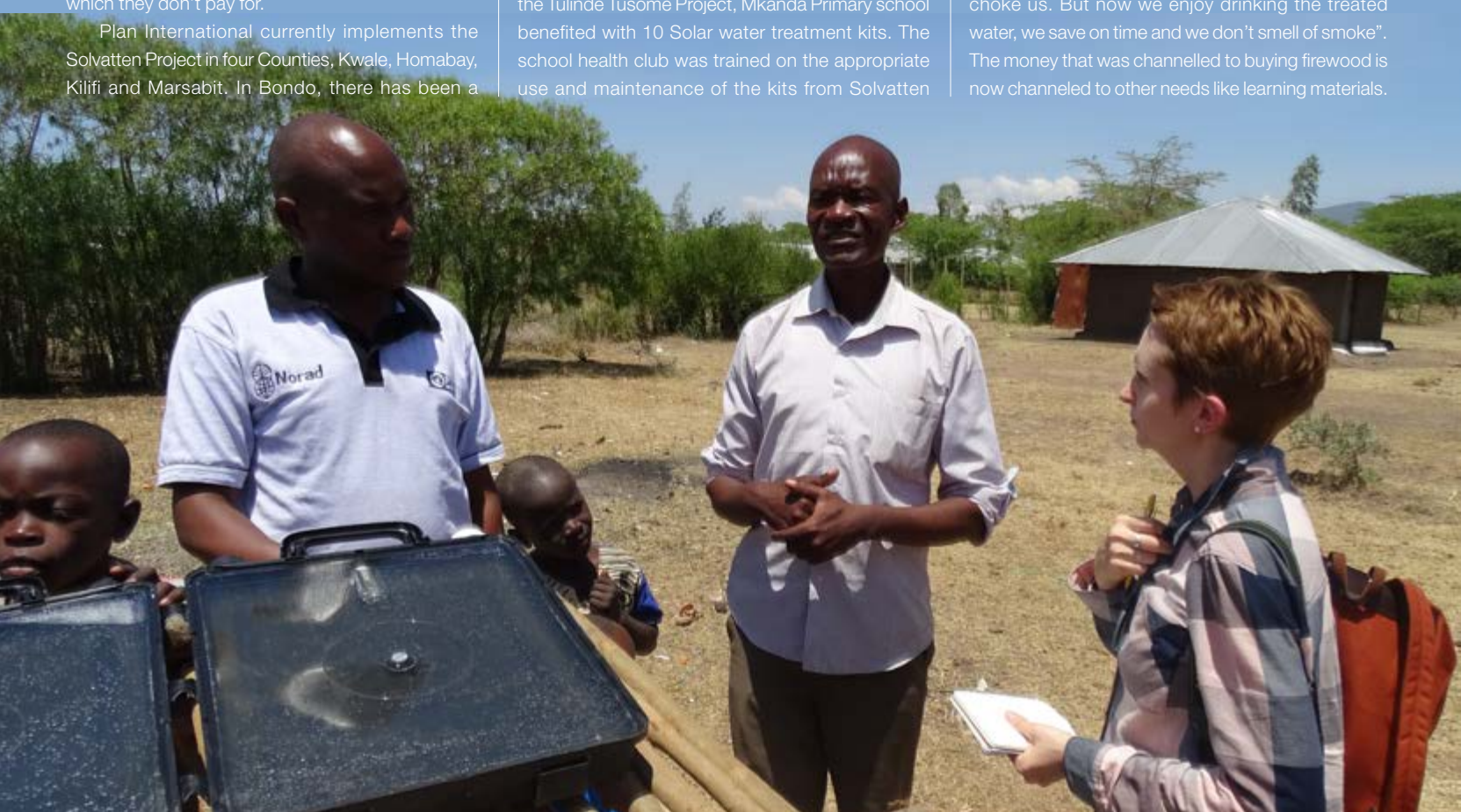
An interaction between Plan International Staff, a beneficiary and a donor during the donor in Homabay programme unit.

Number of households supported by Plan International Bondo with solvatten kits for water treatment.