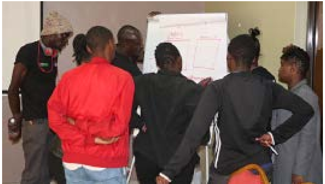
C4D Ambassadors learning the different camera frames they can use in photography.

https://www.facebook.com/SafeandInclusiveCities/