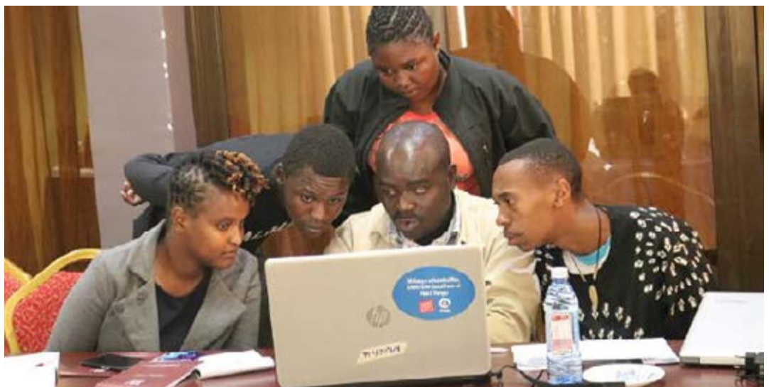
C4D participants during the training.