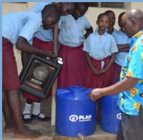
A boy from the school health club filling container with treated water.

In Homabay County, the project was privileged to host two donors from Sweden who visited to check on the progress. They were able to visit the Plan International Offices in Homabay, the Ministry of Health Office and they later on interacted with children who had gained from the solvatten kits. The Solvatten project in Homabay has distributed 142 solvatten kits which have all been dispersed to households.