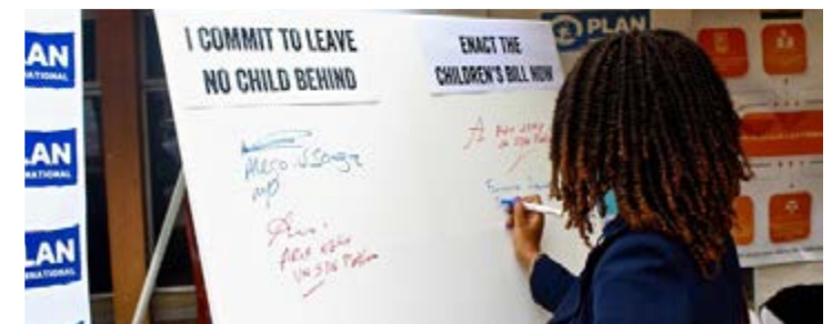
Members of Parliament appending their signature on a canvas as a commitment to ensure they will support the enactment of Children's Bill into Law.