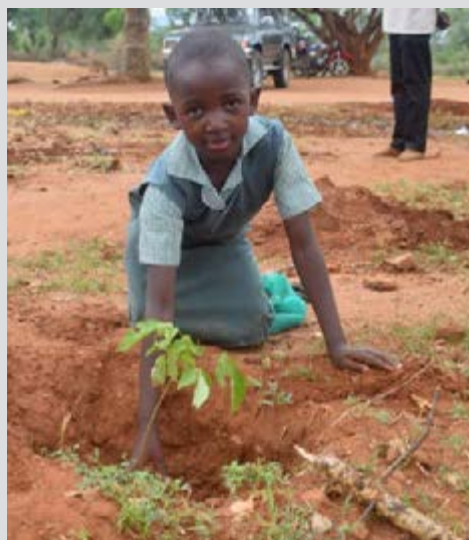
A girl posing for a picture after planting a seedling.