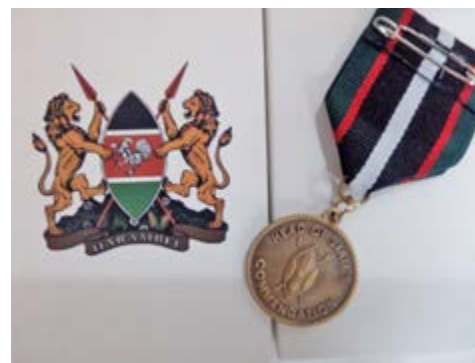
The Head of State Commendation Award.