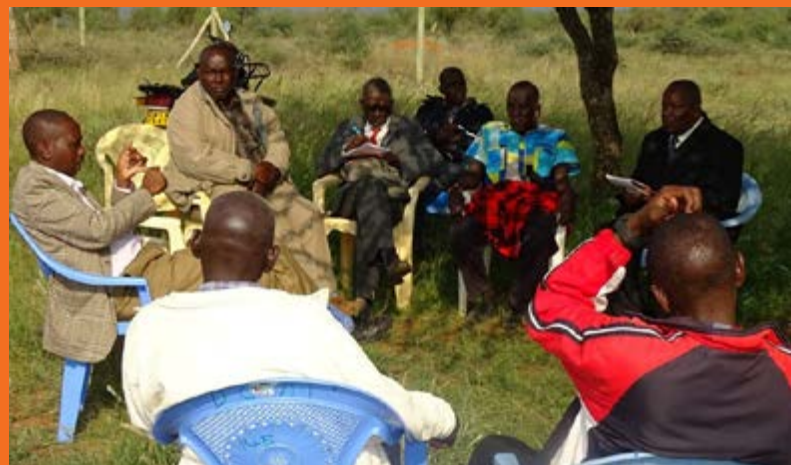
Elders from Kajiado and Tharaka Nithi having a conversation.