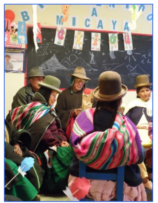
Women and men meet in an ECCD centre in Bolivia.

The studies incorporated varying levels of focus on primary duty bearers including analysis of existing policies. Some of the reports do highlight the importance of a strong policy environment as a basis for leverage and advocacy. The Bolivian report notes a lack of legislation supporting children's rights and the absence of a gender dimension in education and health policies relevant to children (B.ES2). The Ethiopia report summarises some of the key policies and guidelines at national level and finds little that explicitly addresses gender inequality. The importance of strengthening data collection, Pakistan).