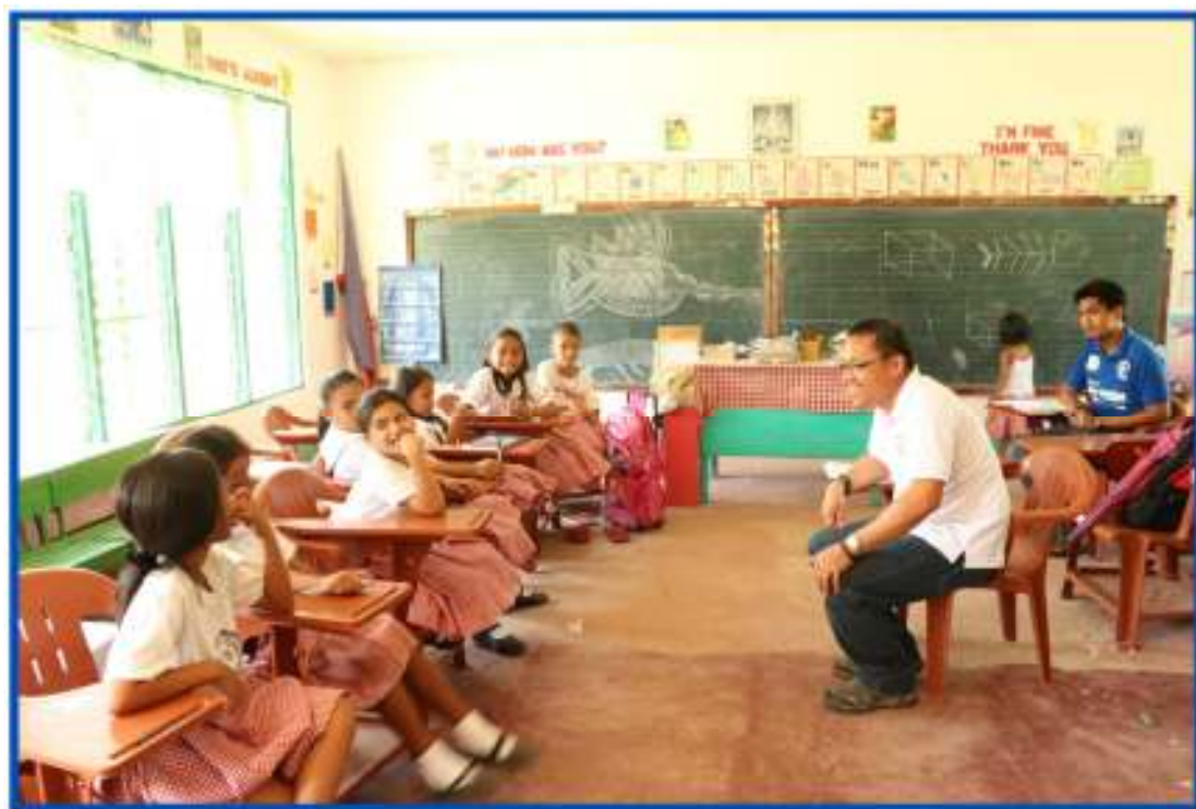
One of the FGDs with girls conducted in Eastern Samar. The FGD participants were grouped according to social categories of sex, age, and geographic location.

Plan International conducted 36 focus group discussions (FGDs) with 339 persons (87 boys, 87 girls, 74 men, 91 women) from 11 villages in eight municipalities and one city in Region VIII to learn more about how they perceive their lives now two years after the devastating Typhoon Haiyan struck their areas. The questions focused on what has changed with their lives and their current issues and concerns.