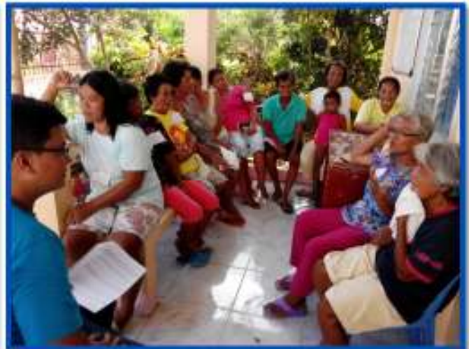
Left photo: FGD with men from Barangay 62, Tacloban City. Right photo: FGD with women in Barangay San Andres, Julita, Leyte.

This is a quick and “surface level” learning activity. Further assessments may be designed basing from the results of the FGDs. It is indeed necessary to triangulate these with secondary data and interviews with Plan staff and other agencies working in the areas.