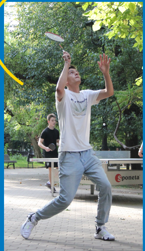
Young people playing sports in the park with our partner National Youth Foundation.

We hope to get a chance to work with you or meet you at some point during the year.