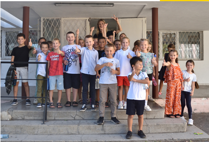
Children from Ukraine at an education centre in a Romanian school in Constanța, through our project with our partner Jesuit Refugee Services.