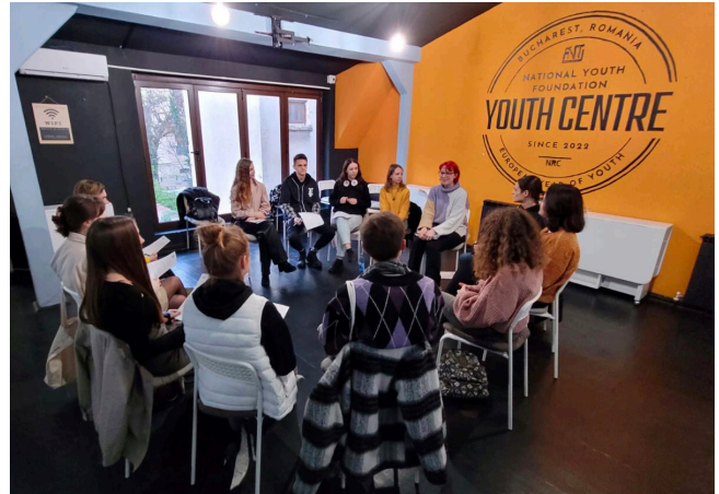
Youth consultations with young people at our partner National Youth Foundation's centre.

Across all the 22 focus groups, young people impacted by the war in Ukraine spoke of wanting to be actively engaged in their country's reconstruction and recovery to bring new ideas, innovative thinking and accountability to the future of Ukraine. This policy paper summarised the key discussions from these consultations, including 53 youth participants from Romania.