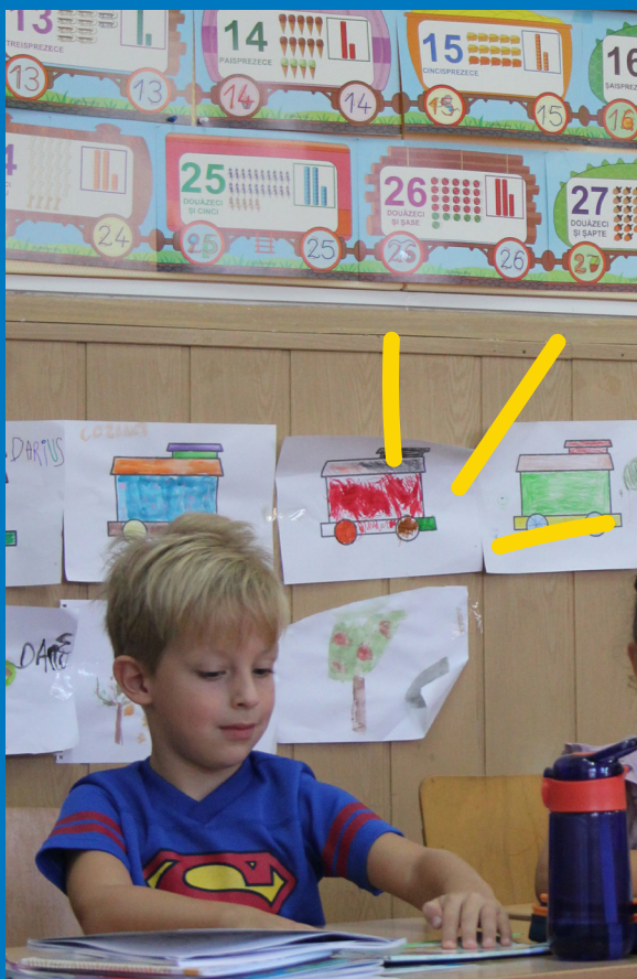
Boy from Ukraine at an education centre in a Romanian school in Constanța, through our project with Jesuit Refugee Services.

Children from Ukraine attended more than 10 education centres through our project with Jesuit Refugee Services: in Bucharest, Constanța, Brăila and Galați.