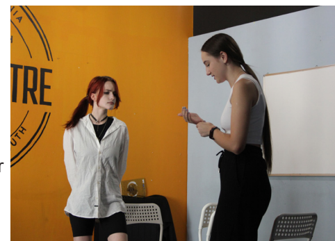
Drama rehearsal at our partner National Youth Foundation's youth centre in Bucharest.

Working through our partner ADRA, we provided voucher assistance for food and other basic essentials such as winter coats, hygiene products and children's clothing to 489 Ukrainian refugees.