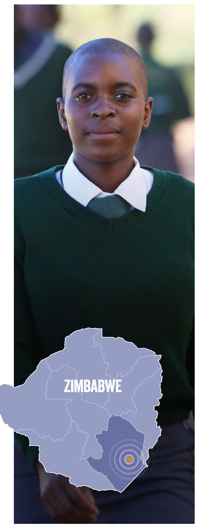
A 14-year-old Zimbabwean school girl isn't sure if her family will be able to afford next term's fees.

Given that unequal gender norms and power dynamics underpin child marriage, study data were analysed using an adapted Social Norms Framework. The adapted framework was used to understand how programming can disrupt risk and drivers of child marriage. It also explores how the existing resources and assets of adolescent girls, their families, and broader support systems support healthy trajectories for adolescent girls across the socio-ecological model, including social and structural factors inherent to humanitarian settings.