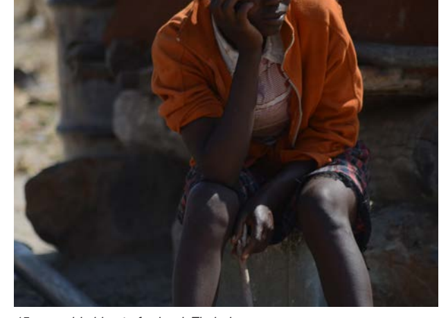
15-year old girl out of school, Zimbabwe

households: were two interconnected themes that resonated strongly as a key concern of adolescents across all data. In most instances child-headed households were a result of parents migrating to South Africa for work for extended periods, as opposed to the death of parents. Adults and adolescent girls who participated in participatory community analysis discussed how parents' migration to South Africa deprived adolescents of supervision and guidance, facilitating child marriages. In most stories about parental migration, child-headed households were associated with sexual violence and exploitation against adolescent girls.