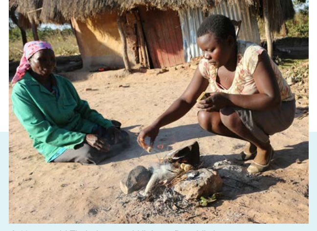
A 16-year-old Zimbabwean girl lights a fire while her grandmother watches.