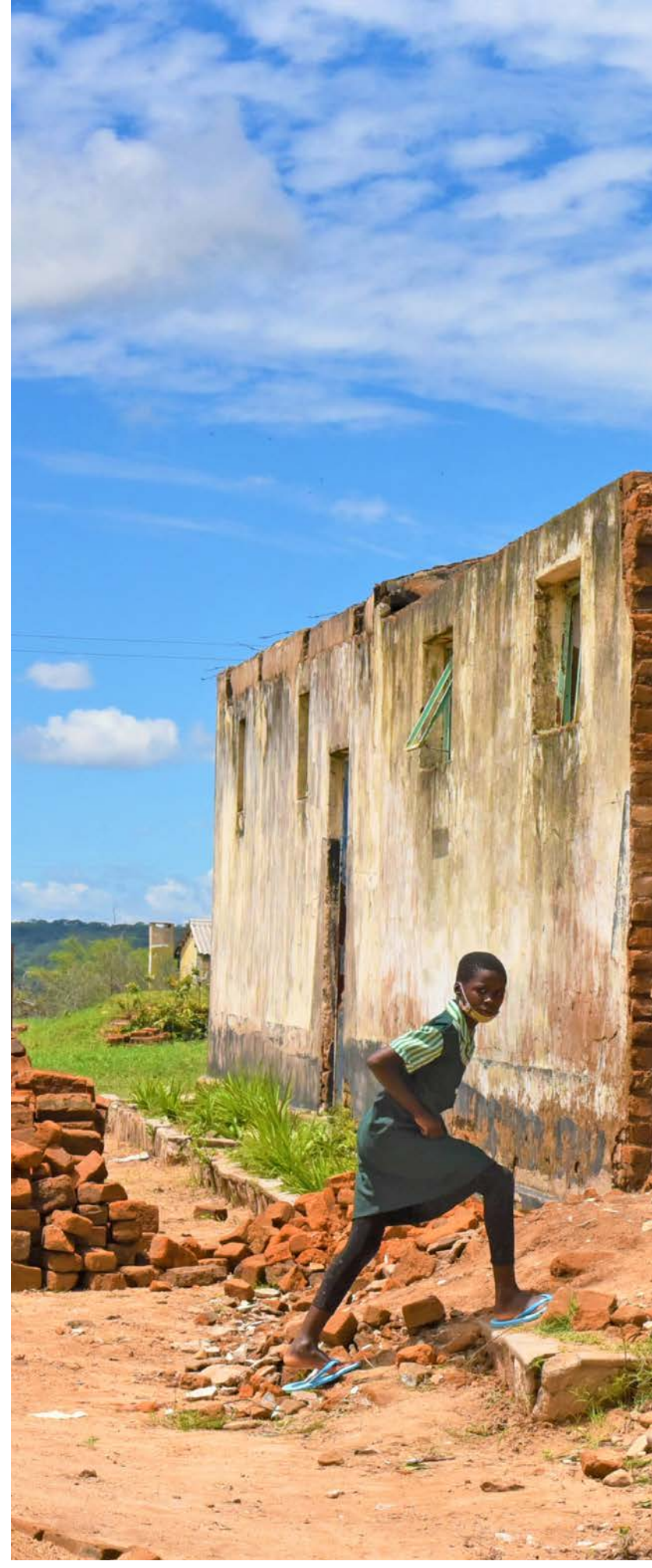
A schooldgirl entering her school in Zimbabwe.

The study also demonstrated that COVID-19 exacerbated drivers of child marriage. At the same time, findings indicate that an existing ecosystem of support persons, community resources, programming, services, and institutions has the potential to protect, care for, and support adolescent girls. Therefore, investment should be allocated to support community (adolescent)-led gender transformative programming to prevent and respond to child marriages in Chiredzi, while external interventions should ensure that structural interventions fill the gaps in this system of support.