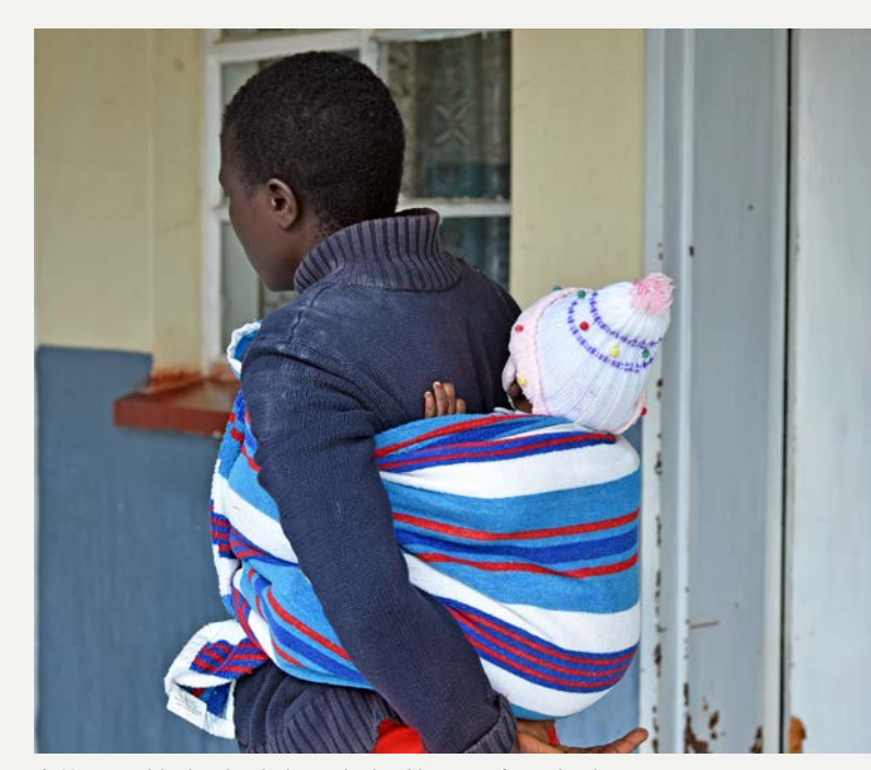
A 19-year-old takes her baby to the health centre for a check-up in Zimbabwe.

Data across methods illustrate the detrimental effects of child marriage on adolescent girls' overall health and wellbeing resulting from abandonment, violence, and lack of support from family, friends, and community. A common theme across data is that adolescent girls are forced from their parental homes and/or those of their husbands, and therefore often lack the support they need to find safety. Data indicate that girls, particularly married girls, are ostracised and lack a sense of belonging, which seems to lead to adverse mental health and psychosocial outcomes. A few stories centred on acute cases of psychological illness where married girls both attempt and commit suicide. Stories shared in SenseMaker also illustrated how the combination of child marriage with the lack of SRH services can affect health, while complications in childbirth were noted as a theme in the stories collected.