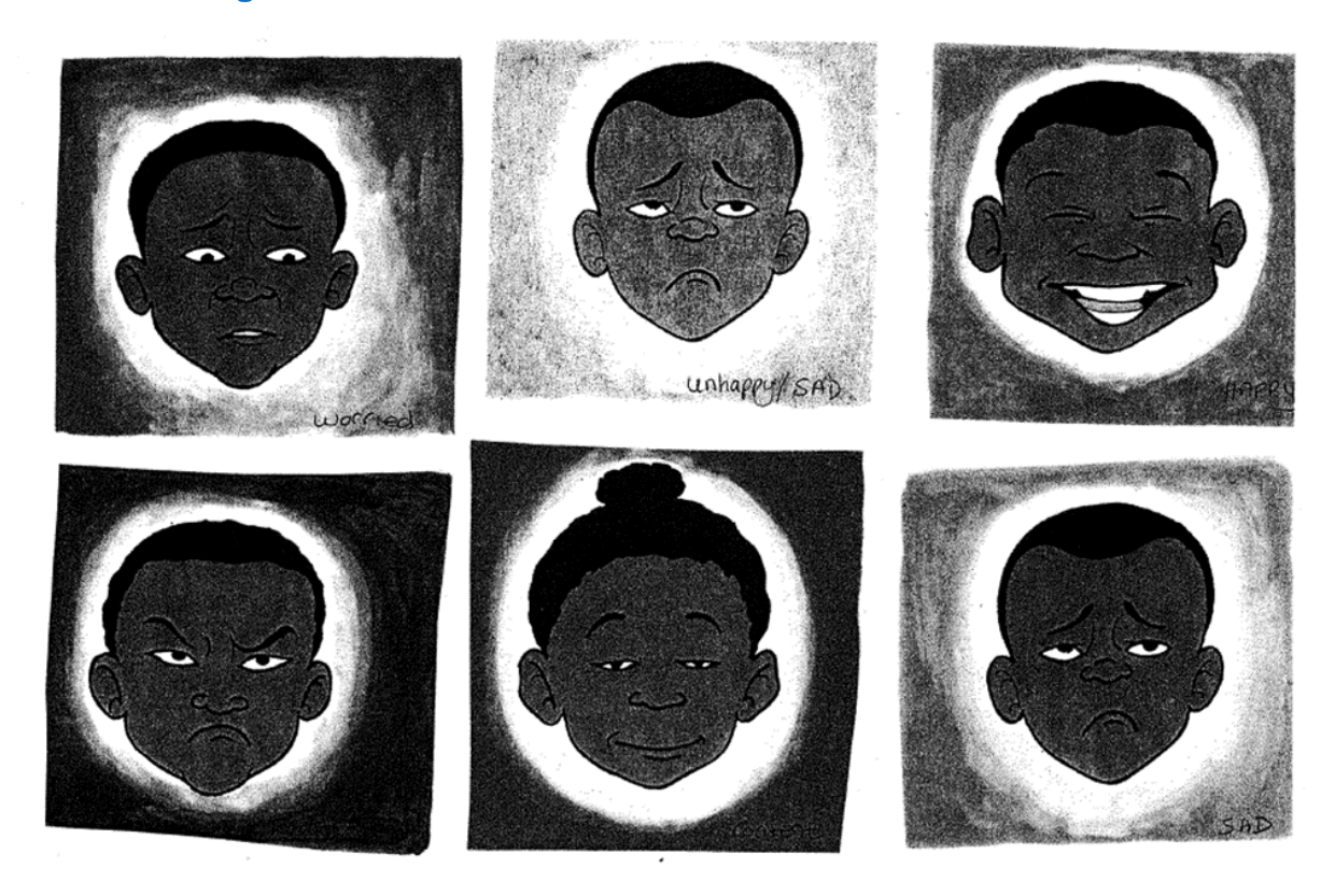
Appendix 5: Emotion cards used in interviews with children with disabilities in Malawi and Uganda