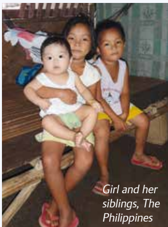
Girl and her siblings, The Philippines