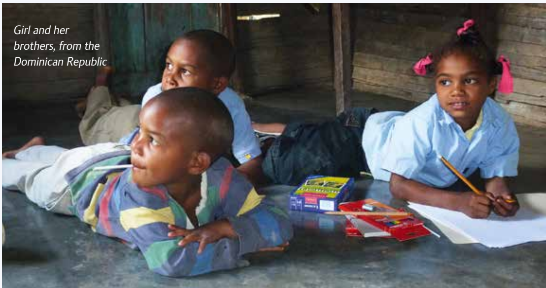
Girl and her brothers, from the Dominican Republic