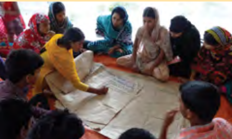
Young people chart out the climate risk in their community

The members of Purakata Child Organisation in a far-flung village in Bangladesh have good grasp of climate change, particularly how it relates to their community. More importantly, they have clearly taken a keen interest in their role in raising awareness about these issues.