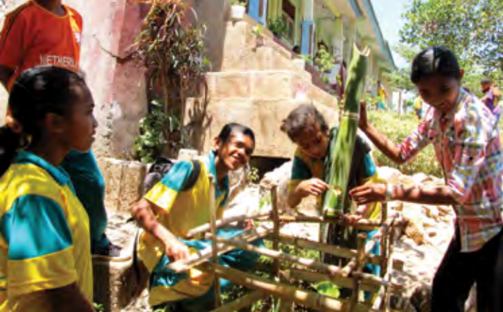
Children set up the infusion system in their school garden.

samples supplied by Plan Indonesia under the child centered climate change project to support families to diversify their crops and plant trees to reduce soil erosion. A one meter bamboo tube with small holes is installed near the tree, tightened by a small rope, and the root covered with leaves to maintain soil moisture. The system works like drip irrigation to provide slow and controlled administration of water in the area of the root system. Water is distributed in a uniform and slow manner, drop by drop, in a quantity and with a frequency that depend on the needs of the plant. To regulate the water flow, holes can be sealed by thin wooden sticks.