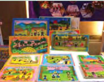
Teachers and students in Northern Thailand create their own big picture books on climate change and DRR in ethnic languages to be used as teaching tool for children in their schools.

– Representative from Thanh Commune and local project management board, Dakrong District, Vietnam