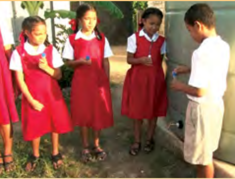
Students from Sopa in Tonga test the water quality in the tanks at their school

Freshwater in Tonga comes from rainwater harvesting or extraction from a thin freshwater lens with the island's highly porous limestone. For the community of Sopa, water shortages have always been a priority issue, and with salt water intrusion due to rising sea levels and changing rainfall patterns due to climate change, it has become even more urgent. 4CA has carried out a number of activities in light of this need, especially with the children in the community.