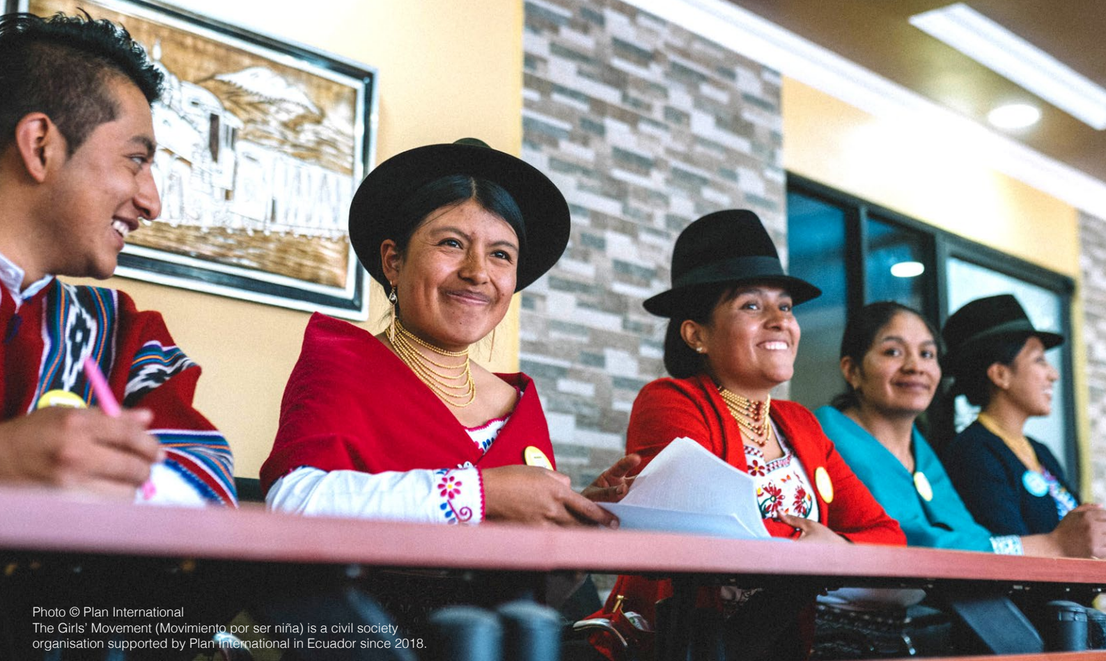
The Girls' Movement (Movimiento por ser niña) is a civil society organisation supported by Plan International in Ecuador since 2018.