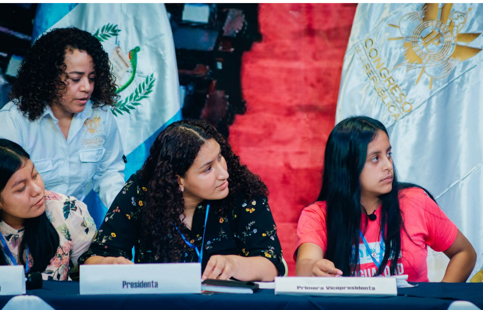
To mark the International Day of the Girl in Guatemala, girl leaders from across the country came together to form the first girls' parliament in the country. During a plenary session, the girls aged between 8 and 17 shared some of the problems that affect girls in their communities and proposed solutions.

young women's everyday lives. Girls know what actions are needed to enable them to meaningfully and safely take part in decision-making, however it is not their individual responsibility to dismantle the barriers preventing them from doing so. Only by listening to girls and ensuring the dissemination of their voices, will action towards gender equality be effective and lasting.