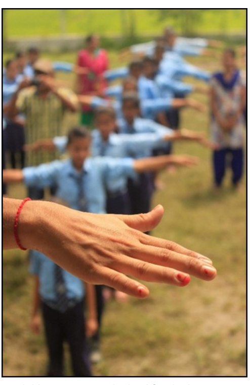
Children at a special school for the hearing impaired during an assembly

"I was very happy when I went to the special school. Everyone could communicate with each other."