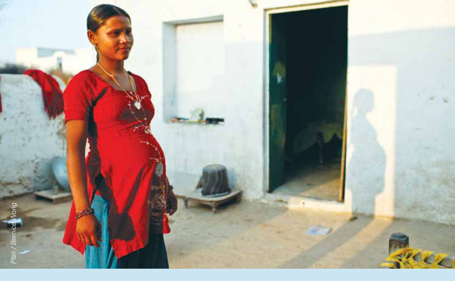
Young girl (16) who is nine months pregnant in Lunkaransar, Rajasthan

Role model girls realise and value the importance of education and are also aware courses and jobs. They have exposure to the outside environment, a social network and aspirations for themselves. As shared by few respondents: