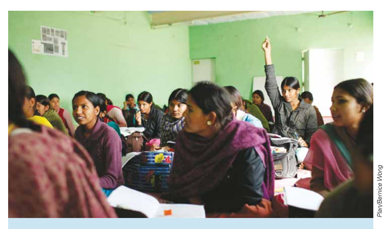
Girls studying at BS in Lunkaransar, Bikaner district, Rajasthan

Plan India supports young women getting jobs in BS, several respondents said. In addition to BS, Plan also supports community-based organisations of children, more popularly known as Bal Manch and Kishori Prerna Manch (KPM). Girls are empowered through education and vocational training in skills such as sewing and computer knowledge.